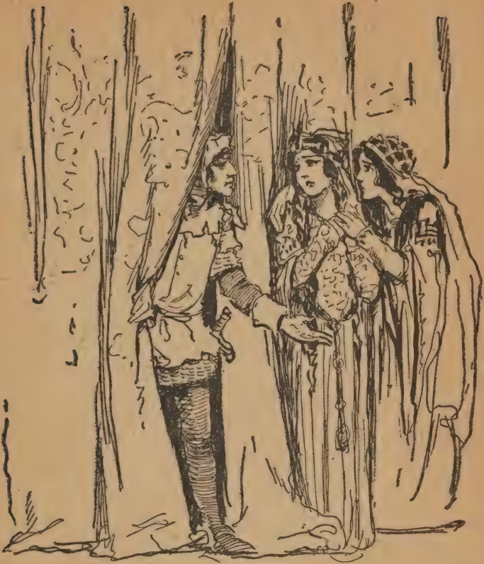
He recounted the visit of the spy.

but win out of this house for half an hour, I do honestly tell myself that all might still go well; and for the marriage, it should be prevented."